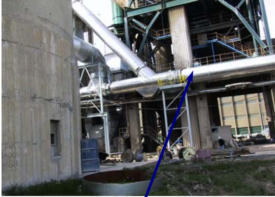
Cooler Exhaust Duct