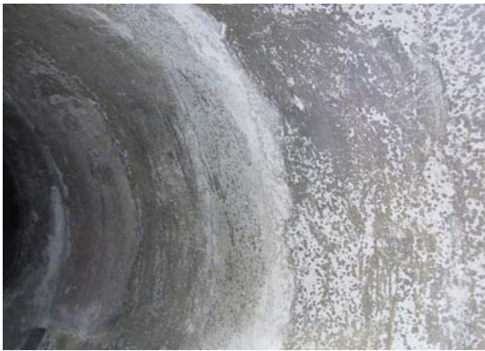
Completed Ceramite® Lining