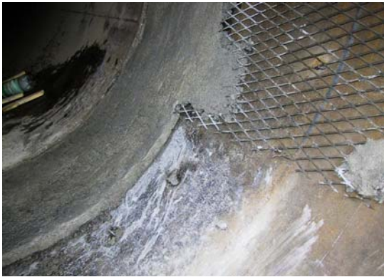
Ceramite® Field Mixed & Trowelled