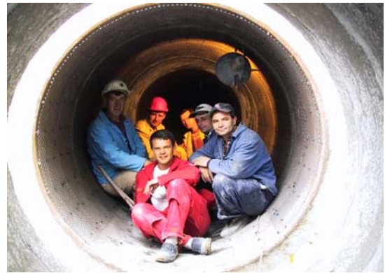
Anxiously Awaiting More Ceramite®