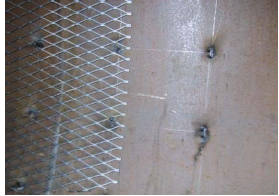
Retaining Anchors & Mesh