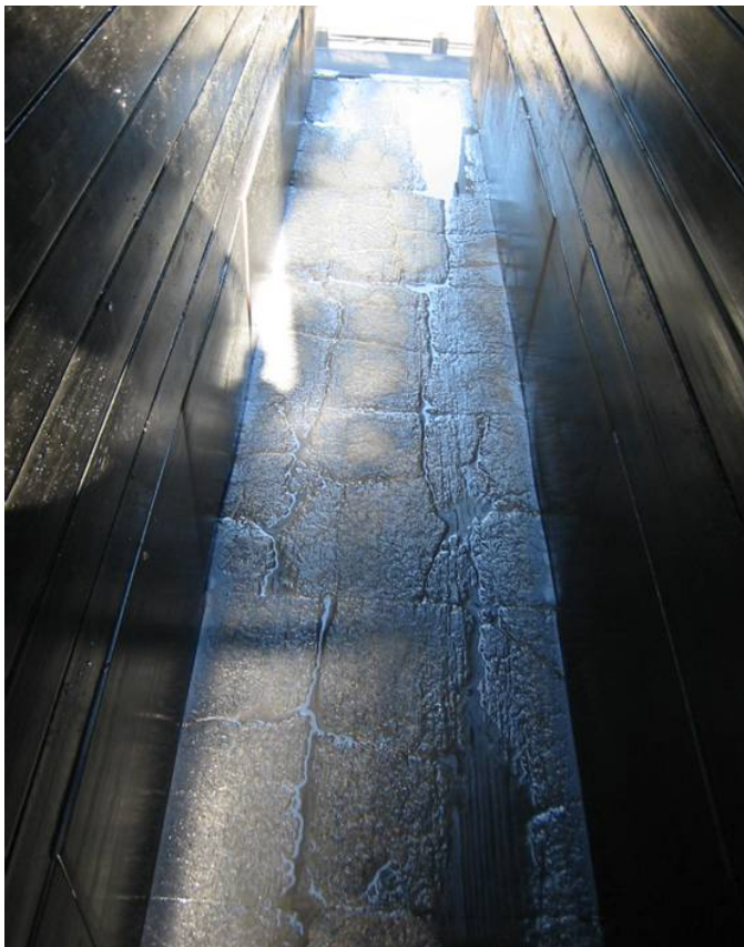
Ceramite® BKR Floor Section in Service Since 1994!