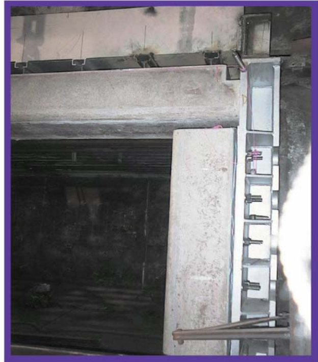
Lintel Meeting Furnace Jamb

WHY? THERMAL SHOCK RESISTANCE - WILL NOT SPALL IMPACT RESISTANCE - WILL NOT BREAK APART ANCHORING STRENGTH - EASY TO BOLT INTO PLACE POSITIVE DOOR SEAL - PROTECTS SUPPORT STEEL FROM OXIDATION COST EFFECTIVE - SAVES NON PRODUCTIVE DOWNTIME