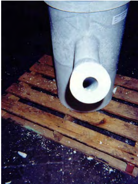
Discharge Snout of the Crucible This part replaced Vesuvius' Silicon Carbide.