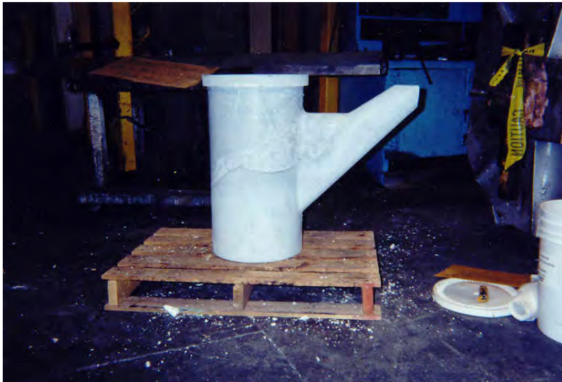
Ceramite® CSA Crucible for Chrysler, Etobicoke Piston Manufacturing