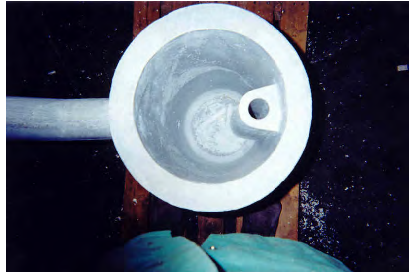
Internal View Part Weight – 226#